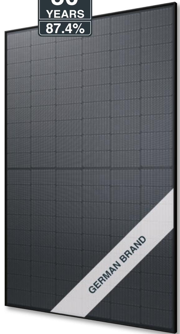
Fig. similar 08TFMEN230316A